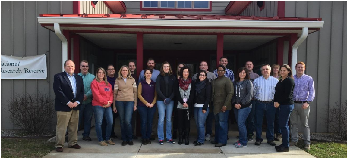
The full group of DNREC staff at their training in Dover, DE

ECOS believes that this program occupies a very valuable place in its portfolio of BPI support to its state members, along with ECOS' online database of completed state projects, webinars and published reports, and national meeting BPI programming for state environmental commissioners and BPI program directors. ECOS also hopes to grow the BPI Skills Exchange program as long as demand among our member agencies continues.