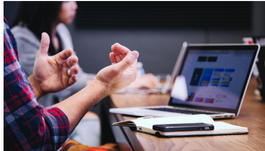
Multilingual public involvement toolkit