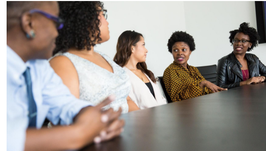
Partnerships with stakeholders and impacted communities