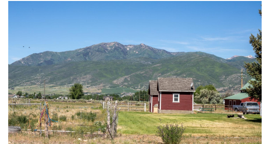
Improved Utah-specific EJ screening tool