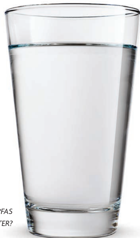
HOW MUCH PFAS IS IN YOUR WATER?

Clean Harbors has extensive experience in providing drinking water treatment systems and can help you navigate this challenging environment by making the right decisions for your situation.